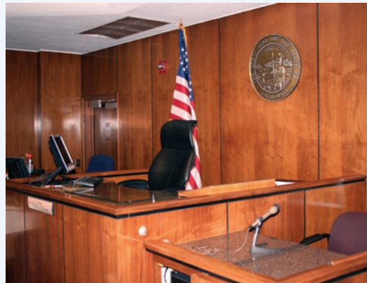
A better courtroom for better service.

Following completion of the "M" Street Civil Courthouse and the subsequent transfer of civil operations to this new facility, the Court embarked upon infrastructure improvements within the main Courthouse. This includes remodeling of the second and fourth floors to expand office space for the Felony Clerk's Office, Accounting Division, and Court Technology Division. Other improvements include new carpeting, interior paint, and improved, user-friendly signage throughout most of the building. In late 2008, the Court Executive Committee approved modernizing the two security elevators. The project, expected to be completed in the spring 2009, will ease the strain on the public elevators.