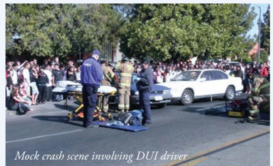
Mock crash scene involving DUI driver

Live DUI Court proceedings represent a promising and effective approach in reducing teen drunk driving. Witnessing the legal and personal consequences of young adult DUI offenders makes this issue more tangible for teens. Given the above, in 2008 the Court partnered with the Fresno Police Department to implement the "Real DUI Courts in Schools" grant funded program at Clovis West, Duncan, Sunnyside, McLane and Firebaugh High Schools. The students were provided an opportunity to see firsthand the consequences of DUIs to individual drivers, crash victims, and local communities. Through mock sentencing, the program emphasized to students the short- and long-term consequences of driving under the influence. In addition, at the conclusion of the sentencing portion, the judicial officer addressed the students directly, answered questions and further highlighted the consequences of driving under the influence.