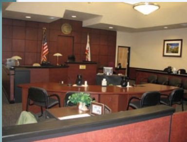
Interior of civil courtroom

pages are some of the capital improvements the Court and State has initiated and/or completed in the last two years.