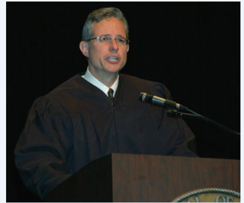
Honorable Brian Arax

The court converted one commissioner position into a judgeship in 2008, however, the position remained vacant by year's end.