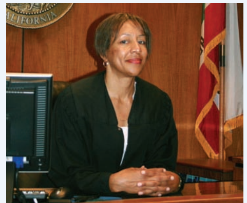
Honorable Glenda Allen-Hill