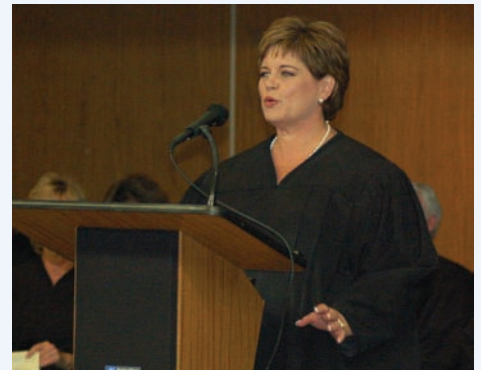
Honorable Kimberly Nystrom-Geist