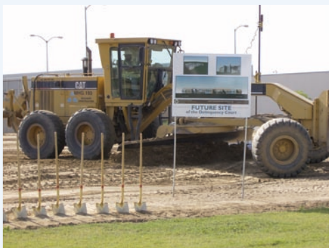
Groundbreaking of the Juvenile Delinquency Court

The delinquency courthouse will share approximately 112,400 square feet with other county justice agencies. The building's design includes four courtrooms, with the capacity to add two more at a later date. Though jury trials are currently not permitted in delinquency proceedings,