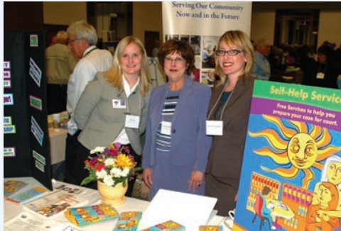
Over 40 organizations participated in the Community Services Fair.

To support these priorities, during the past two years the Court engaged in the following significant outreach efforts.