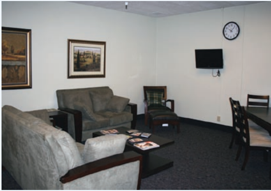
Special waiting area for victims and witness