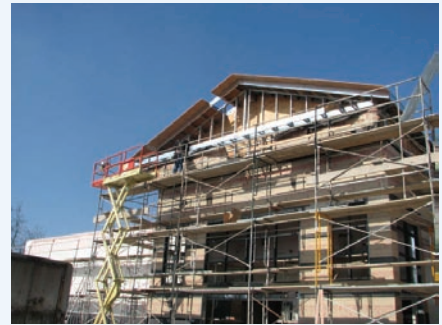
From banquet hall to civil courthouse!

Upon completion in 2010, the 192,000-gross-square-foot facility will include 15 courtrooms and support space for the civil, family law and probate courts including self-help and mediation services.